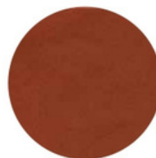
11-455 Sequoia Matt

Frag 01/11 is a FULL-GRAIN vegetable leather, produced with traditional chemical-free tanning techniques. It is a natural product, valued and noted for its light marking, its surface wrinkling and veining, its aroma and its shades of colour. Such features all testify to a prestige product that will gain value over time. This age-old and sturdy material